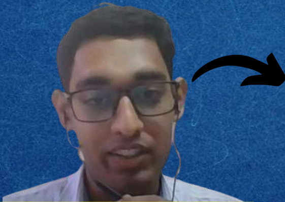
AIR 14 (2023) on 'Sherlocking'