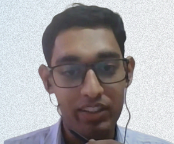
AIR 14 (2023) on 'Sherlocking'

The Sherlocking Prelims Module(s) will help you rewire your approach – teaching you to leverage common sense and foundational knowledge