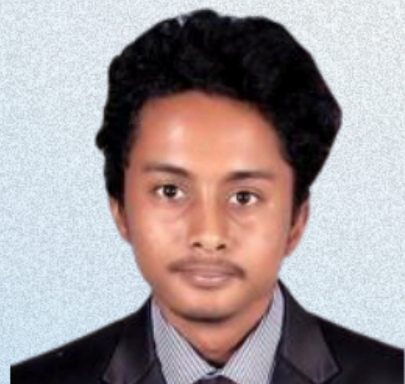
AIR 230 (2023) on 'Sherlocking'